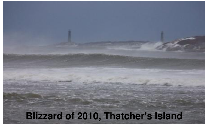
Blizzard of 2010, Thatcher's Island