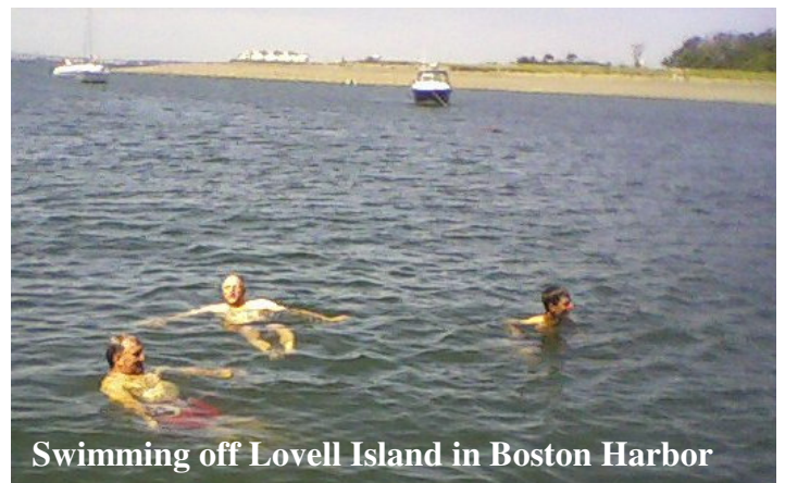
Swimming off Lovell Island in Boston Harbor