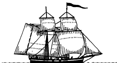
Schooner Hannah - 1775